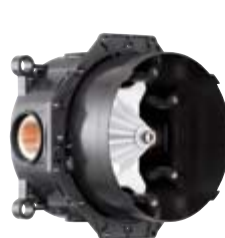
Basic set iBox® universal # 01800180