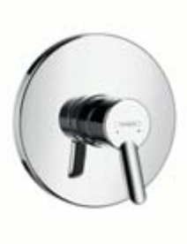
Single lever shower mixer for concealed installation # 31763, -000