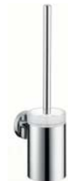
Toilet brush holder # 40522, -000