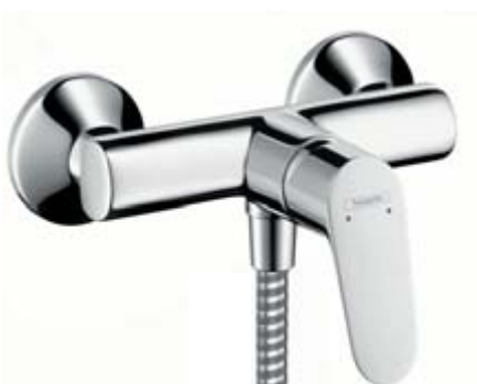
Focus® E² Single lever shower mixer