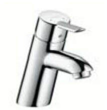
Single lever basin mixer # 31701, -000 Single lever basin mixer Project (without pull rod) # 31711, -000 (not shown)