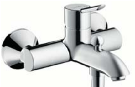
Focus® S Single lever bath mixer