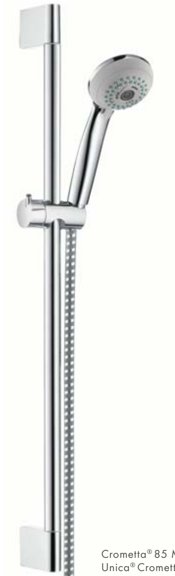
Crometta® 85 Multi/ Unica® Crometta Set