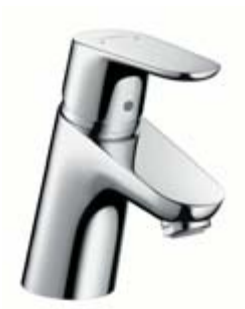
Focus® E² Single lever basin mixer

Focus® E². Dynamic silhouette, ergonomic handle, flattering curves – the design of the new Focus E² mixers clearly reflects the ‘elegance’ philosophy. Exuding simplicity and exceptional quality, the Crometta 85 Vario/Unica‘Crometta set is a perfect match for the Focus E² bath and shower mixers.