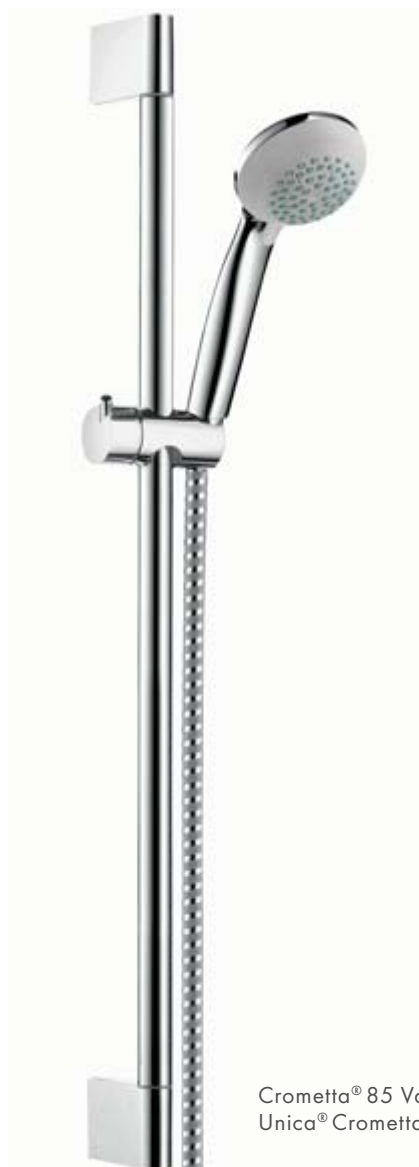
Crometta® 85 Vario/ Unica® Crometta Set