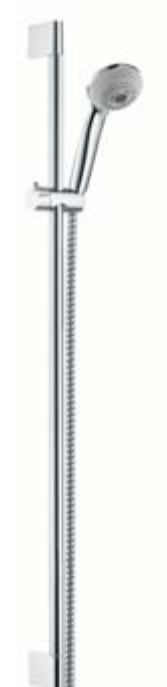
Crometta® 85 Multi/ Unica®/Crometta® set with 1.60 m hose Metaflex shower cover 90 cm # 27766, -000 65 cm # 27767, -000 (not shown)