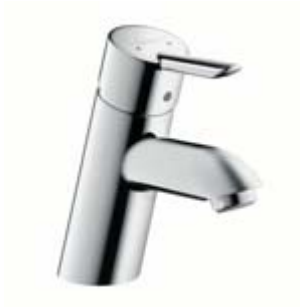
Focus® S Single lever basin mixer

Focus® S. Cylinder, sphere and cone – these geometric shapes are the foundation of the Focus S mixer line. Its characteristic feature is the slim, straight pin handle which makes it a pleasure to operate. A shortened version is featured in the Crometta 85 Multi/Unica® Crometta set where it serves to adjust the shower height.