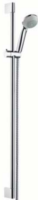
Crometta® 85 Vario/ Unica® Crometta® set with 1.60 m hose Metaflex shower cover 90 cm # 27762, -000 65 cm # 27763, -000 (not shown)