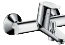
Single lever bath mixer for exposed fitting # 31940, -000