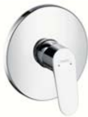
Single lever shower mixer for concealed installation # 31965, -000