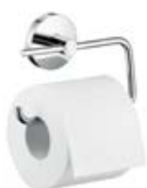
Roll holder without cover # 40526, -000