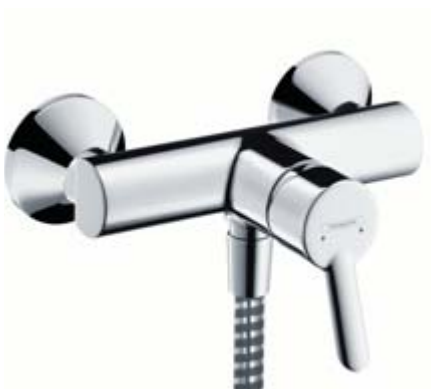
Focus® S Single lever shower mixer