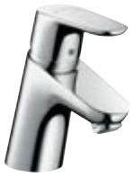
Single lever basin mixer # 31730, -000 Single lever basin mixer Project (without pull rod) # 31733, -000 (not shown)