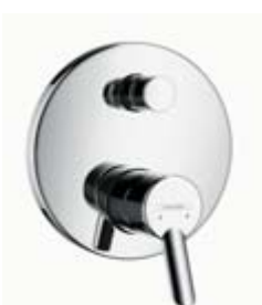
Single lever bath mixer for concealed installation # 31743, -000