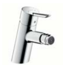
Single lever bidet mixer # 31721, -000 Single lever bidet mixer with chain # 31726, -000 (not shown)