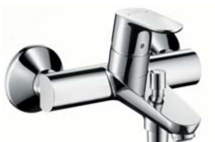
Focus® E² Single lever bath mixer