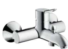
Single lever bath mixer for exposed fitting # 31742, -000