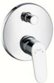
Single lever bath mixer for concealed installation # 31945, -000 with safety combination # 31946, -000