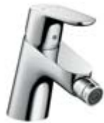
Single lever bidet mixer # 31920, -000 Single lever bidet mixer with chain # 31921, -000 (not shown)