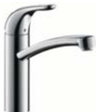
Single lever kitchen mixer # 31780, -000