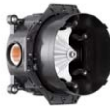
Basic set iBox® universal # 01800180