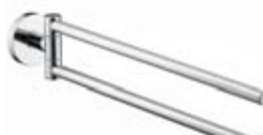
Towel holder # 40512, -000