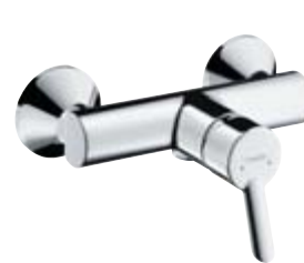
Single lever shower mixer for exposed fitting # 31762, -000