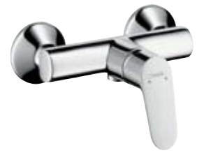
Single lever shower mixer for exposed fitting # 31960, -000