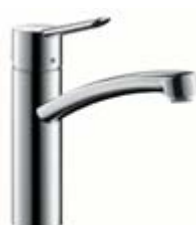
Single lever kitchen mixer # 31786, -000