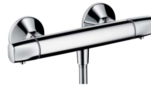
Ecostat® E Shower thermostat for exposed fitting

The Ecostat E thermostat harmonises perfectly with the Hansgrohe E faucet lines. Smooth organic shapes and soft, flowing contours lend these faucet lines both an aerodynamic and elegant tone.