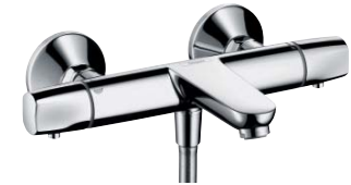
Ecostat® E Bath thermostat for exposed fitting