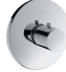
Ecostat® S # 15711, -000, -880 Highflow concealed thermostat # 15715, -000 (not shown)