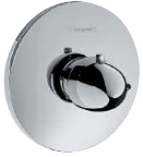
Ecostat® E # 15710, -000, -090