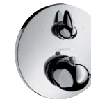
Ecostat® E Concealed thermostat with integrated shut-off and diverter valve