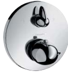
Ecostat® E with integrated shut-off and diverter valve # 15720, -000, -090