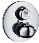
Ecostat® E Start/Stop # 15740, -000