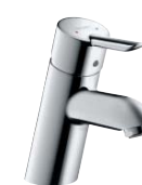
Focus® S Basin mixer