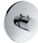
Ecostat® S Concealed thermostat