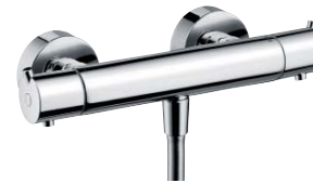
Ecostat® S Shower thermostat for exposed fitting

The Ecostat S thermostat is influenced by the style of the S faucet lines. The basic geometry of circle, straight line and diagonal opens up a world of design possibilities. Manufactured with attention to even the smallest of details, this world of faucets impresses with its refreshing clarity.