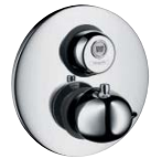
Ecostat® E Concealed thermostat Start/Stop