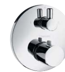
Ecostat® S Concealed thermostat with integrated shut-off and diverter valve