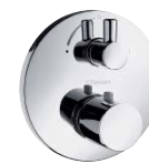
Ecostat® S Concealed thermostat with integrated shut-off valve