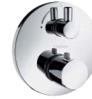
Ecostat® S with integrated shut-off valve # 15701, -000, -880