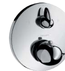
Ecostat® E Concealed thermostat with integrated shut-off valve