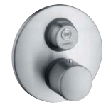
Ecostat® S Concealed thermostat Start/Stop