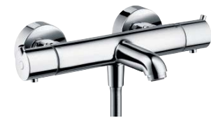
Ecostat® S Bath thermostat for exposed fitting