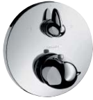
Ecostat® E with integrated shut-off valve # 15700, -000, -090