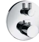
Ecostat® S with integrated shut-off and diverter valve # 15721, -000, -880