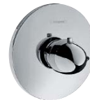
Ecostat® E Concealed thermostat